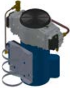
RRM RISER MOUNTED AIR COMPRESSOR