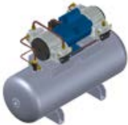
RTM TANK MOUNTED AIR COMPRESSOR