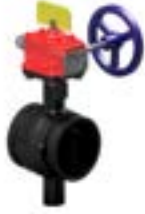
REL300GT BUTTERFLY VALVE - NORMALLY OPEN