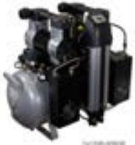
120R-40BQ3 metal cabinet shown