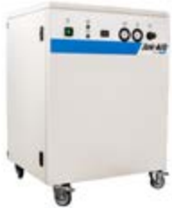
120R-40MQ3 & 2x120R-40MQ6 metal cabinet models shown