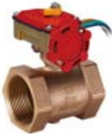
RBVT THREADED BUTTERFLY VALVE