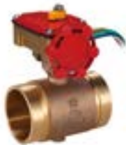
RBVG GROOVED BUTTERFLY VALVE