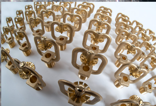
MV Model Medium Velocity Nozzles

The complete set of 72 Medium Velocity Nozzle spray patterns reflects nine discharge orientations and eight nozzle deflector options.