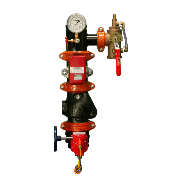
Representative Photograph (subject to change)

Note: The adjustable pressure relief valve is UL Listed only and not FM Approved.