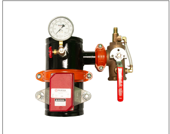
Representative Photograph (subject to change)

The Model CR2 is cULus Listed (VEOY.EX5980) in all sizes and FM Approved (Standard 1626) in 2 in. to 8 in. (50 mm to 200 mm) sizes. The main drain is available with a ball valve or Reliable TD (Test and Drain) valve available with a wide selection of test orifice K-factor choices. An optional pressure relief kit with adjustable pressure relief valve (175 - 310 psi [12.1 - 21.4 bar]) is also available.