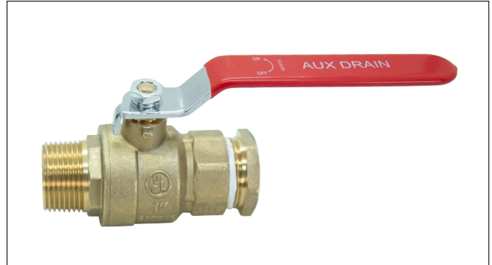
Model REL-DV1 Full Port Drain Ball Valve

The Reliable Model REL-DV1 Full Port Drain Valve shall periodically be given a thorough inspection and test. NFPA 25, "Inspection, Testing and Maintenance of Water Based Fire Protection Systems," provides minimum maintenance requirements. Inspect the valve for corrosion, damage, and wear as required and replace as necessary. Increase the frequency of inspections when the valve is exposed to corrosive conditions or chemicals that could impact the valve materials.