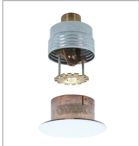
G4XLO QREC ECLH/ECOH Concealed

Important! Reliable fire sprinklers must be handled, stored, and installed in accordance with the guidelines in Caution Sheet 310 and this bulletin. Failure to follow these instructions may result in unintended operation or nonoperation of the fire protection system.