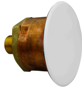
Model G6-80 Concealed Sidewall Sprinkler Components and Dimensions