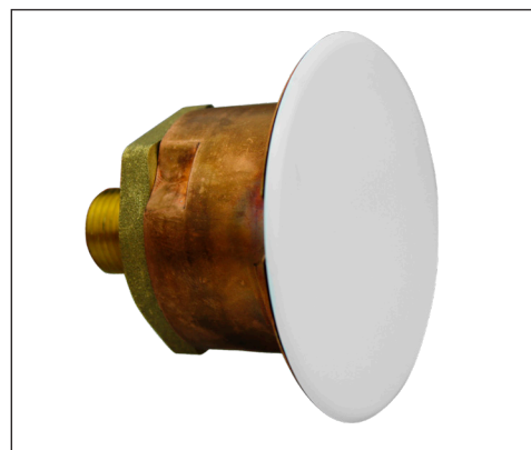
Model G6-80 Concealed Sidewall Sprinkler

Important! Reliable fire sprinklers must be handled, stored, and installed in accordance with the guidelines in Caution Sheet 310 and this bulletin. Failure to follow these instructions may result in unintended operation or nonoperation of the fire protection system.