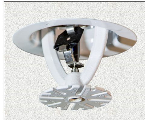
Recessed Pendent (UL only)

To further the development of environmentally compatible and more sustainable construction methods, Reliable has developed and ASTM International has published an Environmental Product Declaration (EPD) for the Model N252EC Pendent sprinklers .