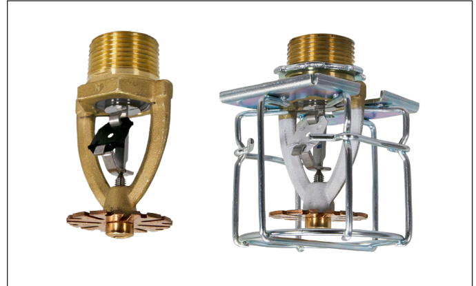
Model N252EC Pendent (with optional K25 guard, right)

The Model N252EC sprinkler offers a maximum coverage area of 196 ft 2 (18.2 m 2 ), which is almost twice that provided by standard coverage sprinklers. This offers the advantage of decreasing the total number of sprinklers, reducing labor and material costs.