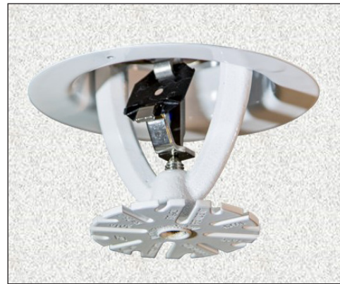
Recessed Pendent (UL only)