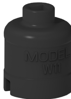
Model W11 (Service/ Spare Head Cabinet Wrench)

For use with Model RFC49 plus sprinklers