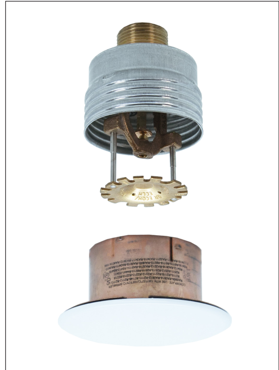
G4XLO QREC ECLH/ECOH Concealed

Model G4XLO QREC sprinklers are extended coverage quick-response concealed pendent fire sprinklers intended for use in accordance with NFPA 13 as well as the requirements of any other authority having jurisdiction. Minimum flow and pressure requirements, based upon sprinkler spacing, are provided in Table B (page 2).