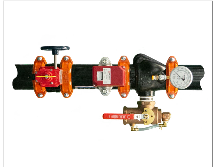
Model FCA Valve

The Reliable Model FCA Floor Control Assembly is designed for use as a floor or zone control assembly in NFPA 13 or 13R applications. The product can also be used as a conventional wet system (shotgun) riser. Grooved connections on each component allow components to be rotated independently, providing maximum flexibility in the field. The assembly includes a butterfly control valve with integral tamper switch, a water flow detector, and a riser check valve with a pressure gauge and a Model TD Test & Drain valve. Multiple orifices and pressure relief options are available for the Model FCA Floor Control Assembly.