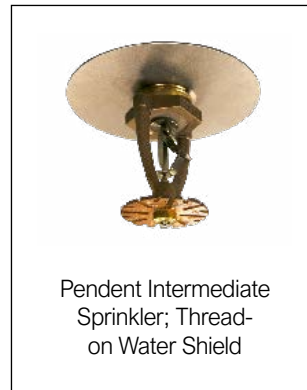
Pendent Intermediate Sprinkler; Thread-on Water Shield