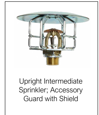
Upright Intermediate Sprinkler; Accessory Guard with Shield