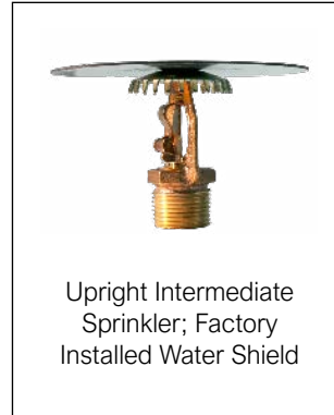
Upright Intermediate Sprinkler; Factory Installed Water Shield

Refer to the Reliable technical bulletin 208 and individual sprinkler product bulletins for listing and approvals, installation, maintenance, warranty, and ordering information.