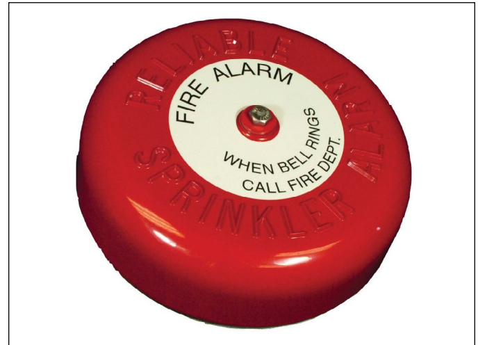
Model C Mechanical Sprinkler Alarm

The alarm continues to sound as long as water is flowing through the sprinkler system. It may be shut off by closing the alarm control valve located in the piping line connecting the mechanical sprinkler alarm with the alarm (wet) or dry pipe valve. Reliable Model C Mechanical Sprinkler Alarm is self setting after each operation, eliminating the need of removing cover plates, etc. to reset internal mechanisms.